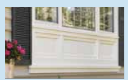
PVC Exterior Trim & Beadboard